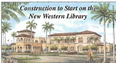
Construction to Start on the New Western Library

In response to the 71.1% "YES" vote for new libraries in Boca Raton, plans are moving forward rapidly for the first of two new facilities: the Western Library.